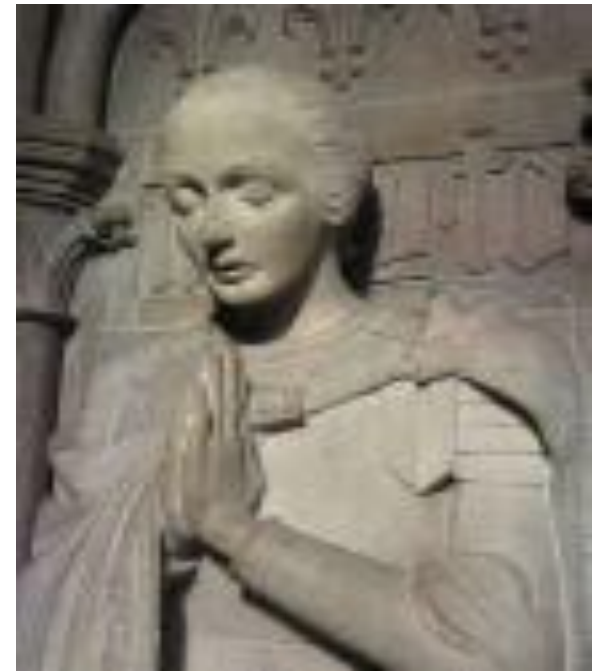
JOAN OF ARC

1453 AD Hundred Years' Wars ends; Constantinople falls to the Turks