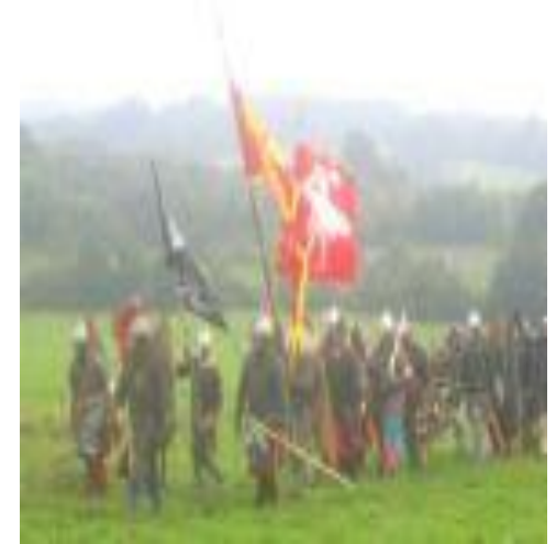
THE NORMAN INVASION 1066

1189 – 1192 AD Richard I of England, and Fredrick I Barbarossa of Germany, and Philip II of France lead the Third Crusade.